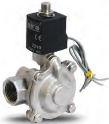
Model : LLD

"aira" Offers HIGH FLOW Diaphragm type solenoid valves, are specially engineered in the construction of Investment Cast CF8 / CF8M / CF3M body for multiple and long lasting operations. valves for the inflammable media / environment / Flameproof / Explosion Proof solenoid coil are available in such application.